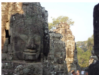
Enigmatic Towers in Angkor Wat