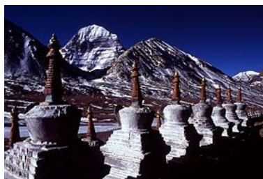
Stupas, with North Face of Mt. Kailash